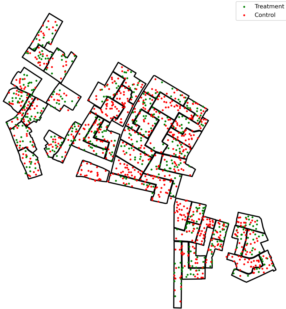
Figure B.3: Highlighted Treatment Areas in TG2 and TG3